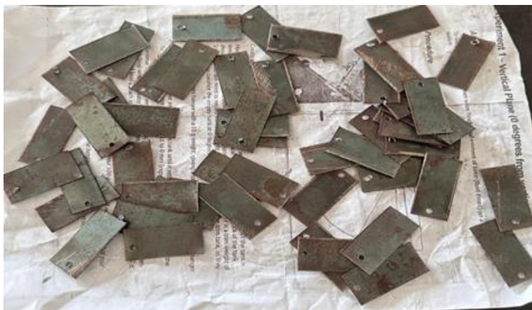
Figure 3: Mild steel Coupon