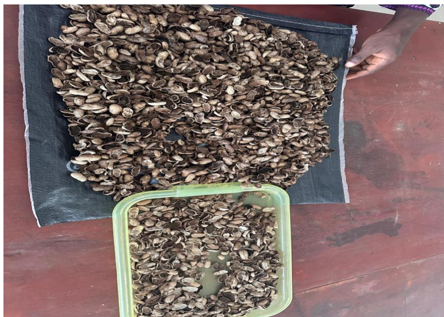
Figure 2: Samples of dried groundnut shell

The Groundnut Shells was washed with distilled water to remove impurities and dried under sun. The dried sample was crushed into powder form using a mortar and sieved through 150 µm mesh screen sieve. 70 g of the sieved powder sample was refluxed in 350 mL of distilled water for three hours. The refluxed solution was filtered to remove any contamination and then dried under the sun. From the dried sample obtained, inhibitor solutions were prepared in different concentrations of Groundnut Shell (GS) extract ranging from 100- 2500 mg/L (w/v).