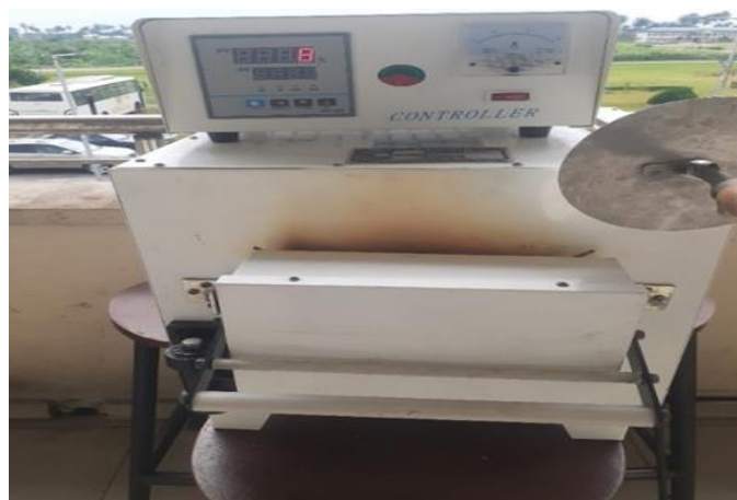
Figure 1: Muffle Furnace for the calcination of Coconut Husk

After being purchased from Effurun market, the coconut husk was dried at 125 degrees Celsius in an electrical oven to eliminate moisture and contaminants. To keep contaminants and moisture out of the environment, the fiber was taken out of the coconut's outer layer and kept in a dry container. To produce the coconut husk ash (CHA), the cleaned fibers were put in an aluminum crucible and heated for 2.5 hours at 500, 600, and 700 degrees Celsius at a rate of 11 degrees Celsius per minute in an electric furnace.